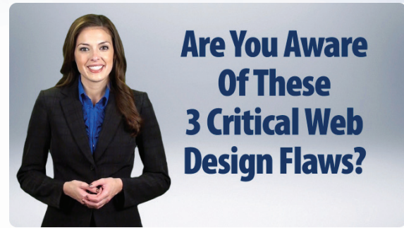
This is the EXACT SAME video hosted on our website with a customized thumbnail. (Yes, it has rounded corners on the video.)

At Tipping Point Marketing, we host our client's videos for them and triple encode all of our videos for our clients so that they play back seamlessly in HD (high definition), SD (standard definition), and on mobile devices without forcing visitors to leave the page. And yes, they work perfectly on iPads and iPhones, everytime—even when streaming over cellular networks. Additionally, we always custom create a video thumbnail so that visitors to your website will want to push play and actually watch your video.