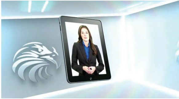
This is the actual thumbnail for one of our videos on YouTube (the thumbnail is generated by YouTube).

our website. Which one would you be more inclined to click and watch?